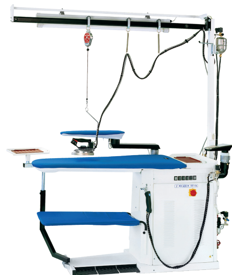
TFC-AVS + TROLLEY